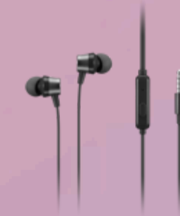
Lenovo Analog In-Ear Headphones Gen II Bulk Package (20pcs) 4XD1T54899

Please click here to view the full list of accessories.