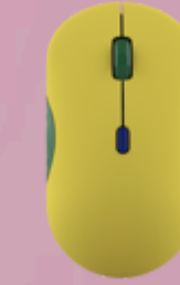
Lenovo 350 Bluetooth Silent Mouse (Fan Edition - Brazil) GY51U71760