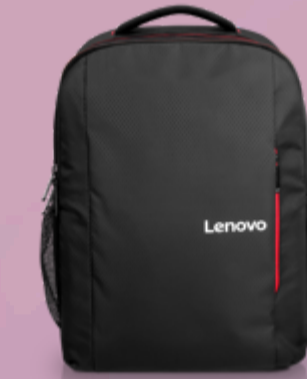
Lenovo 16" Laptop Everyday Backpack B510 4X41U80414

Please click here to view the full list of accessories.